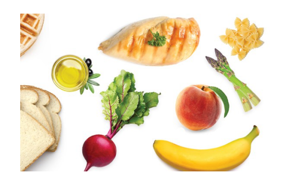
All Solid foods 0